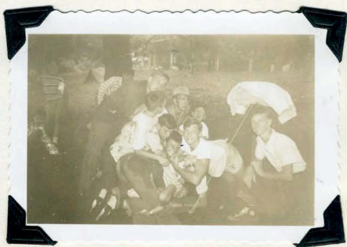
Fun before the 4:00 A.M. climb to the top of Shumont. The boy on the lower left has the best expression on his face.