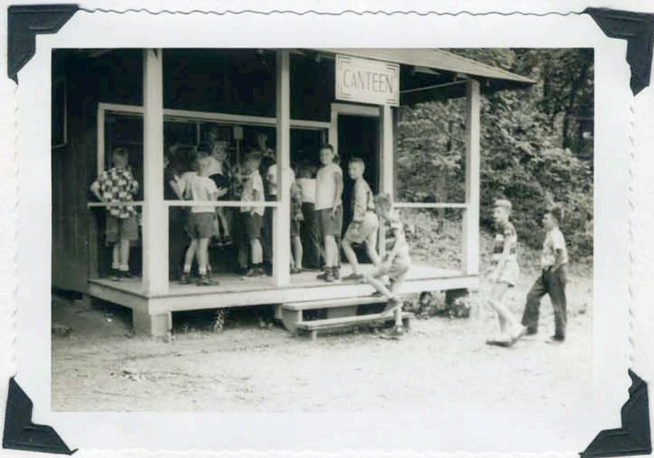
Why so slow, boys? Cold Drinks today. A rare treat!

WE RUSH TO THE CANTEN ... " ONLY SPEND ... FIFTEEN CENTS PLEASE! "