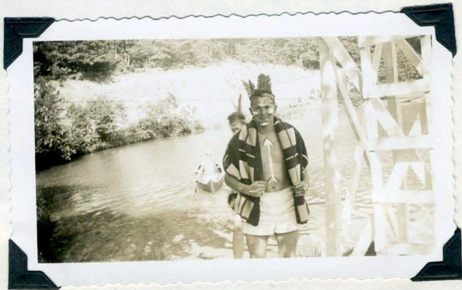
Little Chief True Heart paddles away in the background. The Cherokees washed the Seminoles out of the water in the games competition...