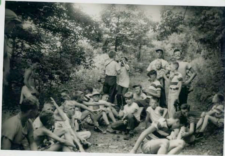
Our feet felt exactly like our faces look... A short rest stop on the Mitchell hike.